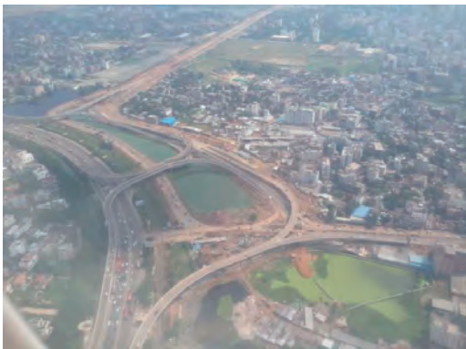
Fig. 3: Panoramic view of constructed interchange

directional flow demands. Desirable solution would require channelization of all traffic through the junction in unidirectional paths merging and diverging on the left. A simple solution was devised by creating a one-way circuitous path on ground in a strip of marshy wasteland beside the railway tracks. To preserve the area bounded by this 'roundabout', a lake was to be developed there by cleaning and dressing the marshy wasteland.