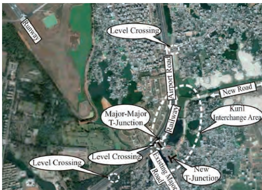
Fig. 1: Project setting

Kuril intersection was a traffic nightmare at the international gateway to Dhaka city. Airport Road, a major dual-carriageway thoroughfare from the International Airport to city, runs alongside a multi-track intercity railway line at the location. Another major dual-carriageway road joins the Airport Road crossing the railway lines to form a complex skewed T-junction cum level crossing. A third dual-carriageway road was under construction that would meet the intersection in yet another T-junction a few meters from the existing level crossing (Fig. 1). A solution to the problem by adopting a standard intersection form was not available; certain amount of ingenuity was required to devise a simple yet effective solution.